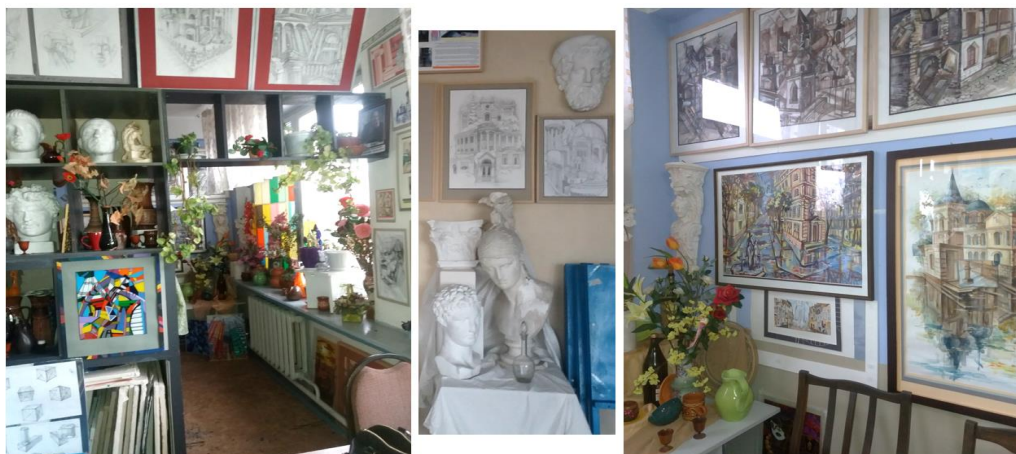
Figure 1. Pictures from the creative workshop

An example for education and creative development would be the Painting Workshop, where I had been reading the Drawing and Painting course for several years, and after defending my doctoral thesis, I moved on to theoretical courses. For an emotional and relaxing comfort towards creativity, we must act through interventions on the aesthetics of the indoor environment that "invite you in a fairytale world miraculous in shapes and colors". And the result is the thematic and creative works of students who express, transmit the affection and well-being of the interior space, so they do not want to leave this workshop (fig. 1).