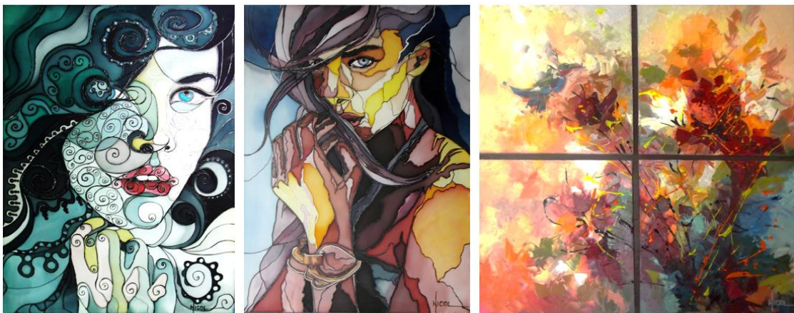
Figure 4. Nicoleta Vacaru, portraits, composition

The main message of the paintings, stained glass, and graphic works of the young painter Nicoleta Vacaru is the love of life, pure feelings, and in general, the desire to be happy, the psycho-emotional state transmitted to the viewer emanates only positivism and sincerity (fig. 4).