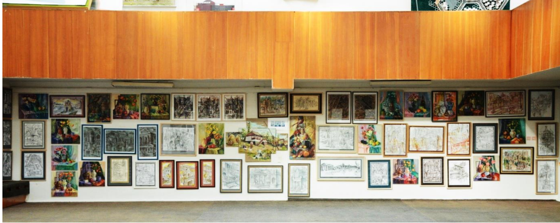
Figure 2. Thematic exhibition of students' works

the works emanated their inner state, through the message of the executed graphics and paintings. The organization of the autumn and spring exhibitions of the student's works is a method of affirmation and a psycho-emotional one through the disposition of the creations for the academic environment. (fig. 1, 2).