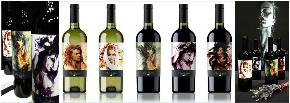
Figure 3. Paintings by Nicoleta Vacaru on the labels of the Moldovan wine collection

dynamics break the patterns through the internal sincerity of the author. This exhibition comes after the first exhibition abroad where Nicoleta Vacaru presented paintings, which the French public liked very much in 2015 [1].