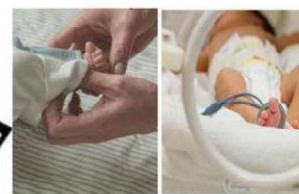
Access for medical devices