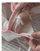
Access for medical devices