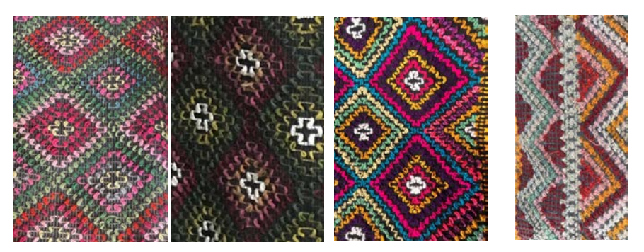
Fig. 1. Rumba with "prăjituri"/ "prăjiței" (fry)

The main element identified in Rumbe "rhombus" has a multitude of valences and stylistic interpretations of aesthetic representation but also ethnolingual. Thus, I found him "baptized" by the creators from Sofia village, Drochia ds., "fry(prăjiţel)"/"cake"/"tudoră"/"dobă" (fig. 2), "half a fry" (fig. 3), "elongated rhombuses"/"standing cake"/"curbence"/"spools" (fig. 3), "square rhombuses".