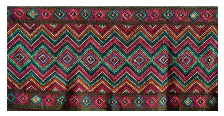
Fig. 4. Triple-border Rumba consisting of a register of rhombuses/"dobe"/"fry" in the middle, flanked by 2 registers with the ornamental element "road"

The structural-compositional constitution of the Rumbes depends on the aesthetic, structural and dimensional conception. Thus, those of small widths had a simpler structure that could consist of ornamental elements (rhombuses) that alternate with the displacement of vertical or horizontal registers in relation to each other. Rumbes with larger widths, have a more complex structure, consisting of a central panel integrated in a frame/border/field made of broken lines that repeat the path of the rhombus called "stream", "rivers" and "road". or frame register is formed by the repetition of ornamental elements called "fry"/small rhombuses or "half cakes/fry". The medium and large width models have the field/border of a complex triple structure, consisting of a register with rhombuses/"dobe"/"fry" in the middle, flanked by 2 registers with the ornamental element "road" or a double compositional structure consisting of a register with "rivers" and one with "road" (fig. 4).